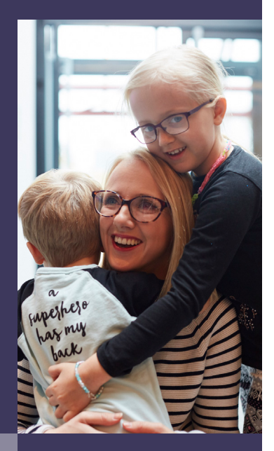
Supported more than 1,000 families affected by neuroblastoma.

Formally challenged the decision by the National Institute for Health and Care Excellence not to approve anti-GD2 immunotherapy for children with neuroblastoma in the UK, paving the way for it to become part of frontline treatment.